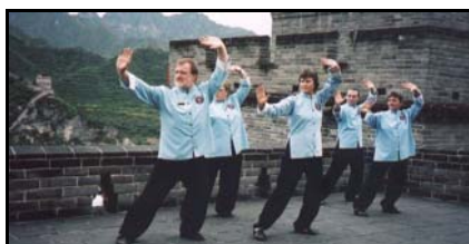
Chi Kung 2 nd Set on the Great Wall of China