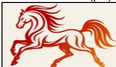
Year of the Horse 2026