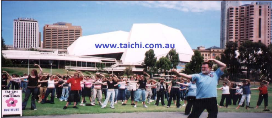
Tai Chi - Chi Kung in Adelaide